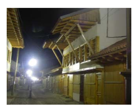
Gjakova market street