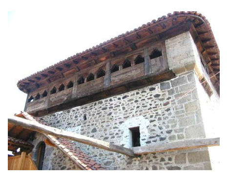
Kulla of Kuklec family, Isniq village

materials, conditions and knowledge, local craftsmen and builders developed local varieties of typical dwellings, whose existence can even be tracked all over Balkans. Such are the elaborate Ottoman influenced 'citizen' type of houses, as well as simpler versions of adobe and stone houses, found in variations all over Balkans and Kosova.