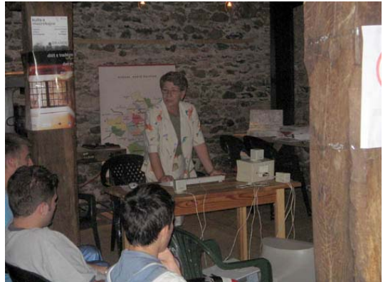
Lectures by prof. Edi Shukriu on cultural heritage and archaeology, as a part of the workshop with pupils

Other than gastronomy and B&B, other services must be offered in order to attract the foreign and local visitors. One should be able to explore the nature with the help of a local guide, participate in traditional activities of food making, weaving, cattle tending, etc.