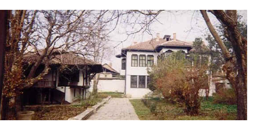
Emin Gjiku ensemble, in Prishtina

<u>Peja</u> – is also known for its market street and mosques, yet its proximity to Rugova Gorge (natural reservation), Drini i Bardhe River