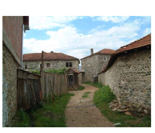
Historic core of Dranoc with Kullas

Problem 3: Defining management guidelines for an isolated case, such would be the Kulla of Mazrekaj family, with the aim of identifying activities and services that would bring economic sustainability for the buildings itself, could potentially become a model for management of heritage in Kosova. Yet, the biggest challenge is how could individual cases become a part of a wider context?