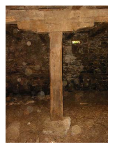
Wooden pillar on the ground floor