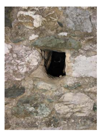
Frengji – shooting holes