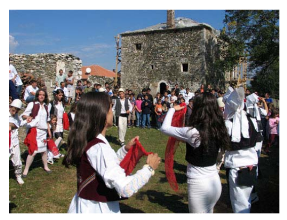
Celebrations of EHD 2004 while Kulla was still being restored