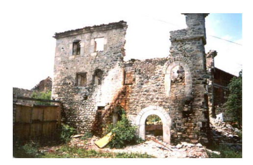
Kulla of Demukaj family, burnt during the war