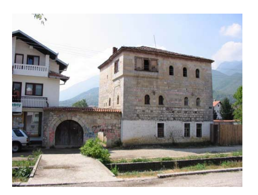
Kulla of Gockaj family, built in town of Peja