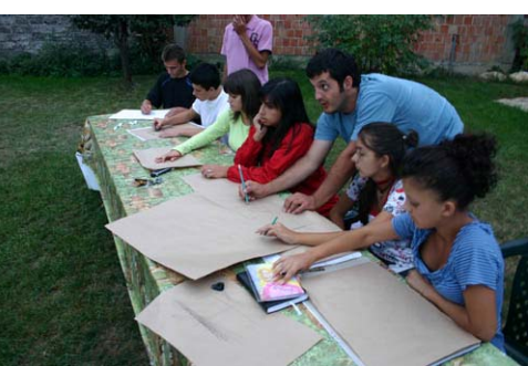
On-site art camp for children, Kulla of Mazrekaj family

Some 191 houses, housing about 1000 inhabitants, populate the hilly slopes of the village. The village boasts with vast green pastures, woods and water