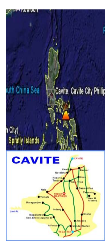
Pictures show the geographical location of Kawit, Cavite, Philippines

The flight of stairs leading to the second floor, which is the principal storey of the house, is of solid narra hardwood, waxed and husked for over a century by energetic househelps. The