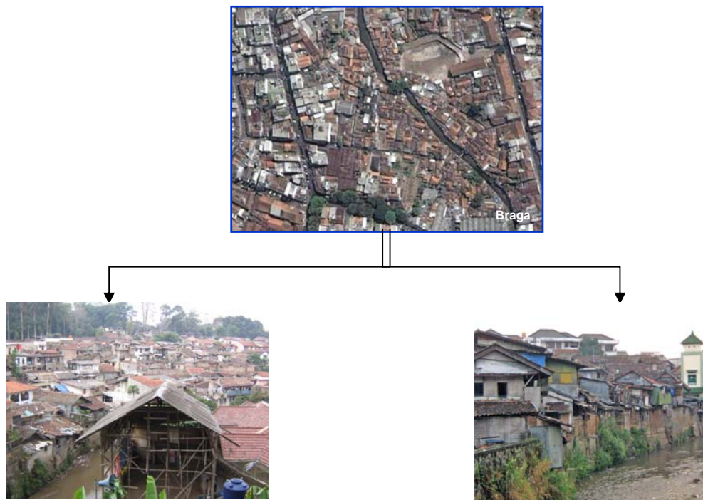
Figure 2.2 Informal Settlement in Urban Area

banks, rail way corridors, and the areas a long the toll roads. They try to survive in the urban area by occupying the land illegally (see Figure 2.1).